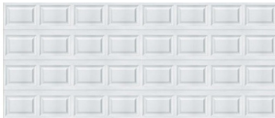
8 Panel Garage Door