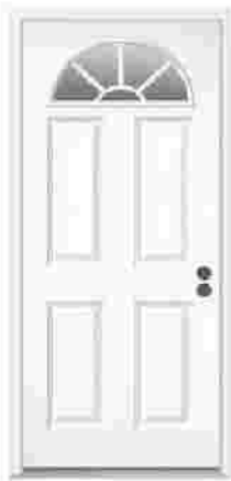
4 Panel with Fanlight Window

The Fanlight window can be clear or stained glass. This is the only acceptable shape of window.