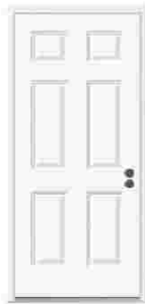
6 Panel without Window